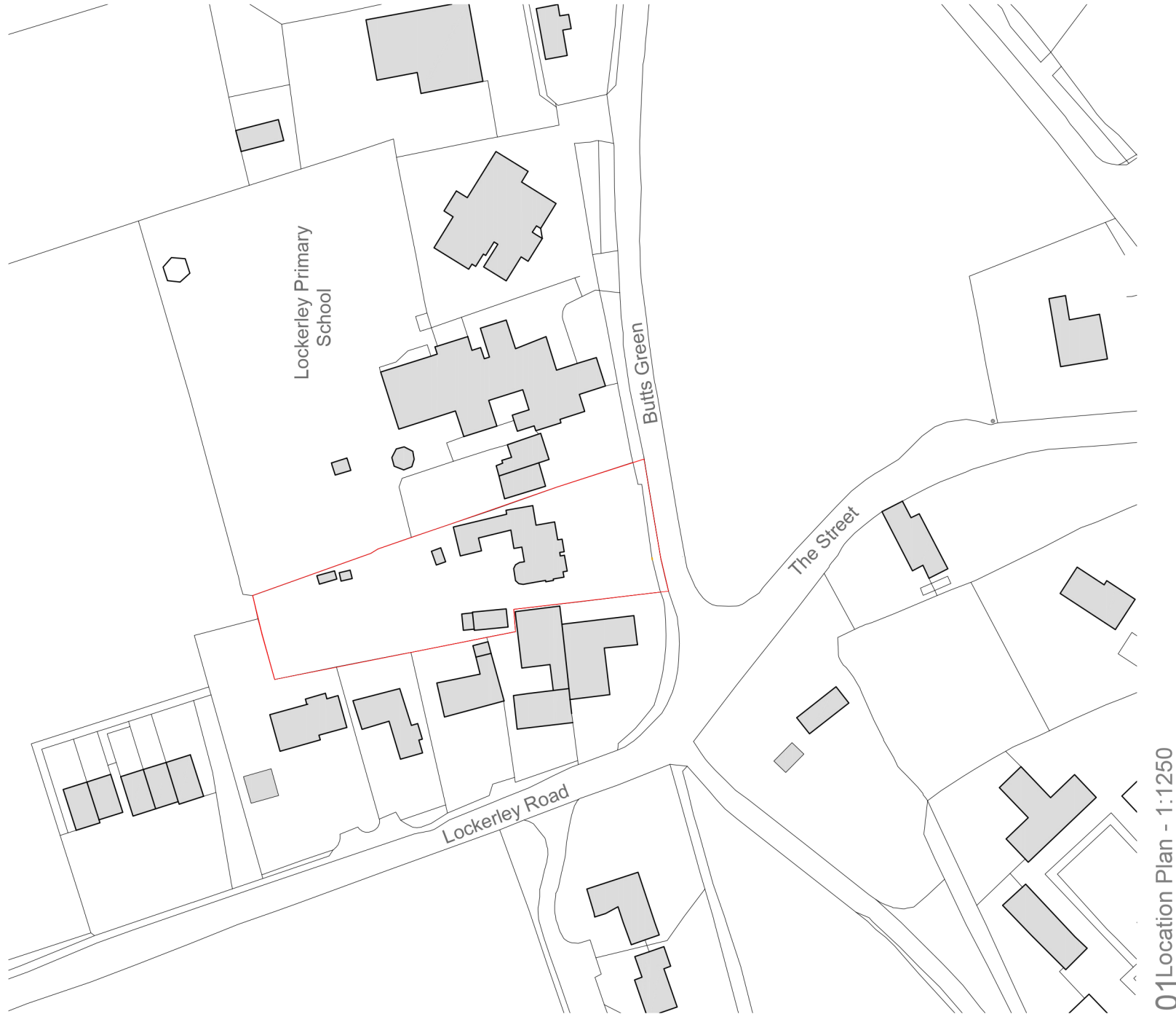
01 Location Plan - 1:1250