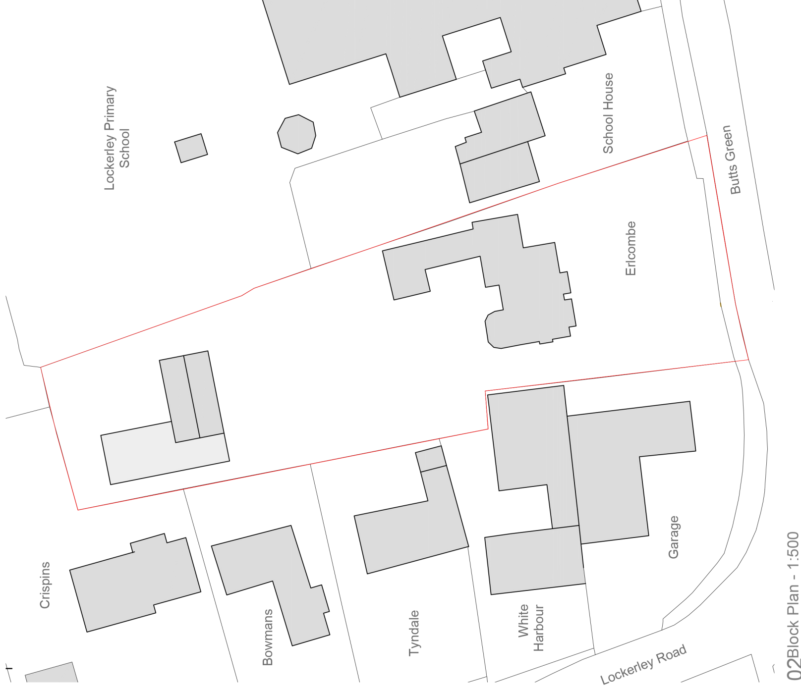
02 Block Plan - 1:500